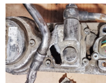
Excessive Actuator Damage

Please contact us via the information below if you have any questions about possible deductions on your turbocharger core.